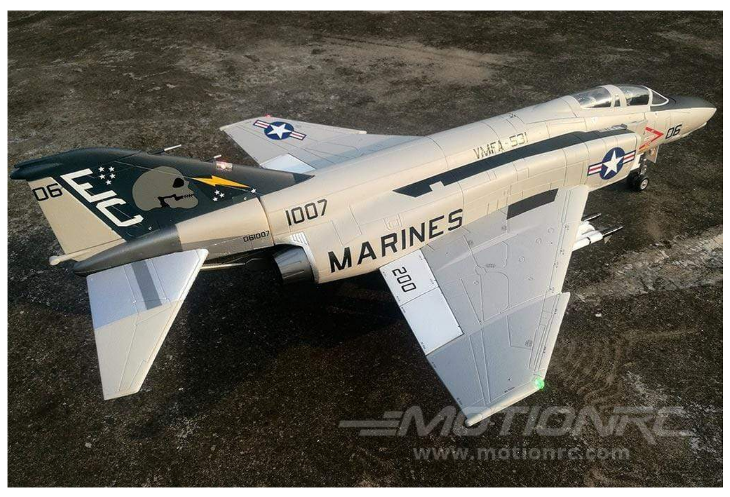
This is an RF-4B that shows the difference between the nose of the two aircraft.

This is a stock image of how the aircraft arrives.